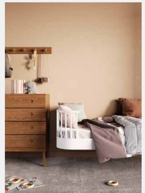
9 x 620 x 2400 mm JUST PAINT PANEL