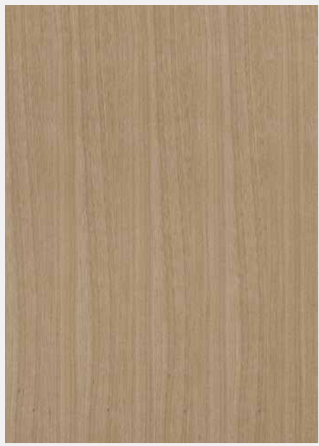
2400/2720/3020 mm OAK