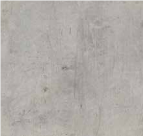
0427 MIXED GREY